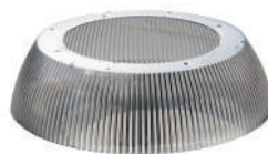
90 Degree Reflector