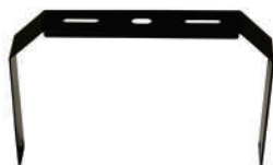
Optional U-Bracket Mount