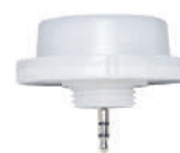
Microwave Dimming Sensor