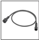
TL-2JUMP65-.5 TL-2JUMP65-1 TL-2JUMP65-2