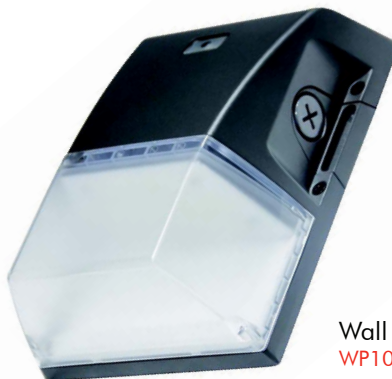
Wall Pack 10 V2 WP10-18W-xxK-V2