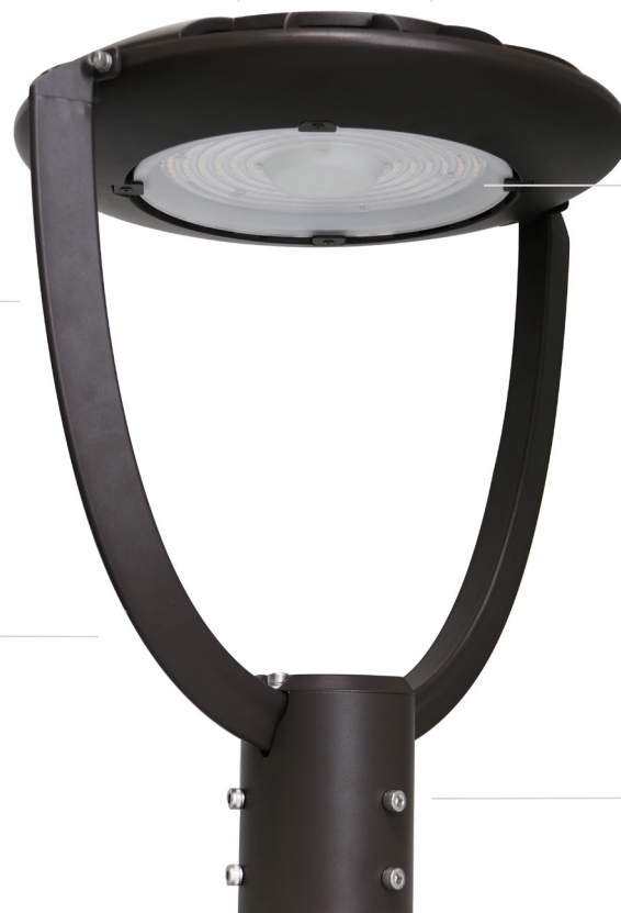
Polyester Powder-Coat Finish (Bronze)