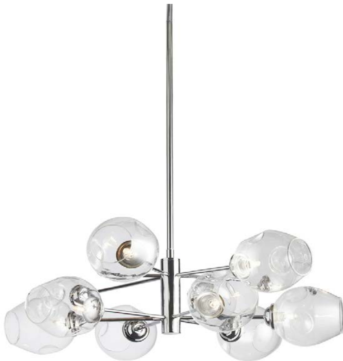
8 Light Pendant, Polished Chrome Finish with Clear Glass

Height 10 Width/Length 26 Depth 26 Weight 8