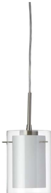
Single Pendant, Chrome, Clear/White Glass

Height 7.25 Width/Length 4.5 Depth 4.5 Weight 3.5