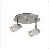
81352BN Brushed Nickel