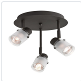
81353 BZ Bronze

* For custom options, consult factory for details.