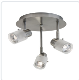
81353BN Brushed Nickel