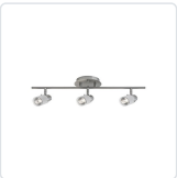
81363BN Brushed Nickel