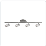
81364BN Brushed Nickel