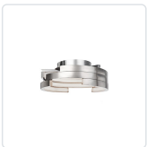
FM12716-BN Brushed Nickel