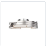
FM12722-BN Brushed Nickel