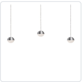
LP10503-BN Brushed Nickel

* For custom options, consult factory for details.