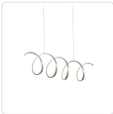
LP93742-AS Antique Silver