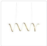
LP93742-AN Antique Brass

A looping radiant line casts light across space in a continuous helical path. The Synergy series is characterized by the rolled rectangular extrusion, which emits soft light through the silicon opal lens. Configured in both linear and ring arrangements, the arcing aluminum allows the curated finishes to be visible at every angle.