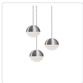
MP10503-BN Brushed Nickel