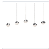
MP10505-BN Brushed Nickel