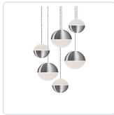
MP10506-BN Brushed Nickel