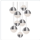
MP10509-BN Brushed Nickel