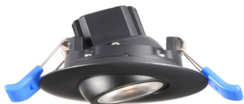
Type IC, Wet & Air-Tight