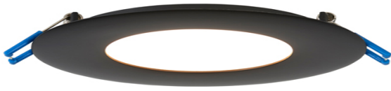
Type IC, Wet & Air-Tight

4" Round Recessed LED With Integral Driver In Connection Box Fits Where No Other Recessed Fixture Can