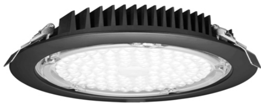
Type IC, Air-Tight & Wet