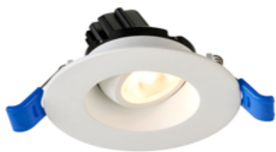
Type IC, Wet & Air-Tight