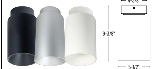
NYLM-5SC Surface Mounted