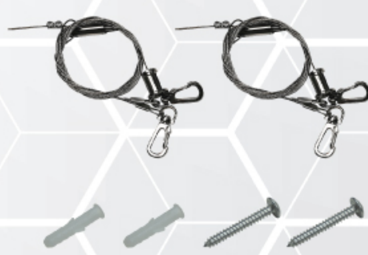
OL-ST8-SUS-KIT (aircraft cable length: 4.92ft.)