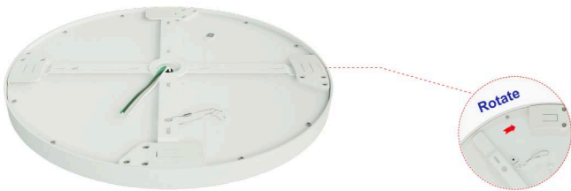
Surface Mount Installation