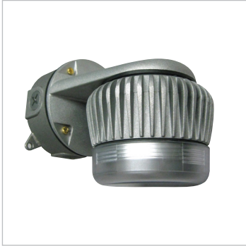
DVBSK-LED Wall mount