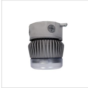
DVAKS-LED Wall mount