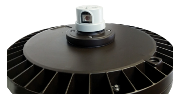
Shown with Photocell