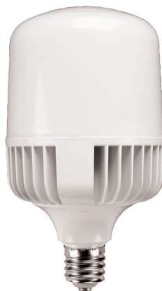
LHID250 E39 base