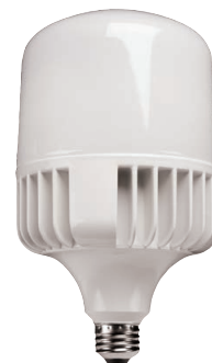
LHID150 E26 base