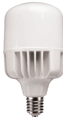
LHID175 E39 base