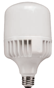
LHID100 E26 base