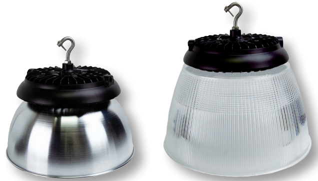
LED Round High Bay with aluminum reflector