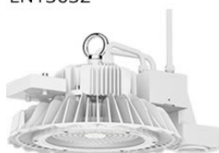
S1/S2 Factory Installed Sensor