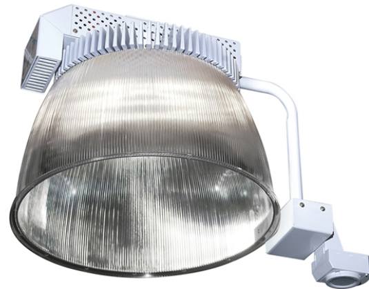
Commerce High Bay with sensor & mounting arm